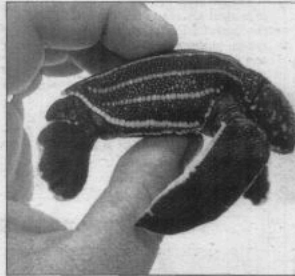
Four live hatchlings, including the one pictured here, were found in the nest when it was dug on Aug. 3.