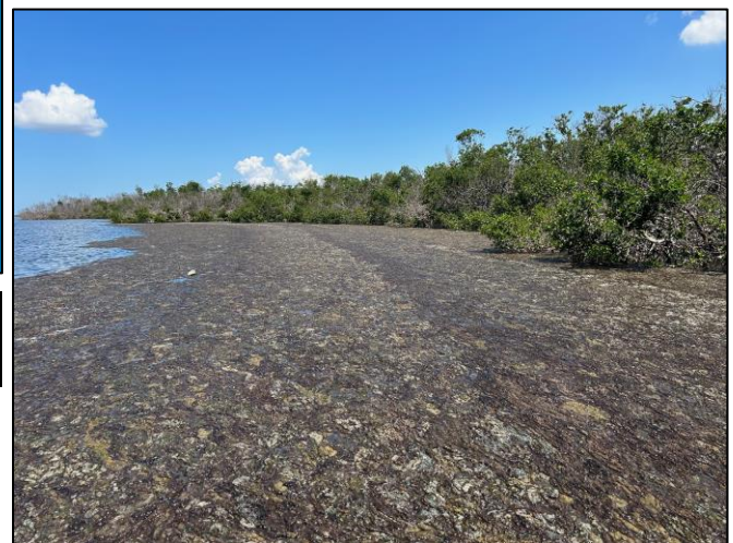
Mats of the benthic macroalga Caulerpa floating to the surface and accumulating in the mangroves in Matlacha Pass on 5/18/23. The City of Cape Coral.