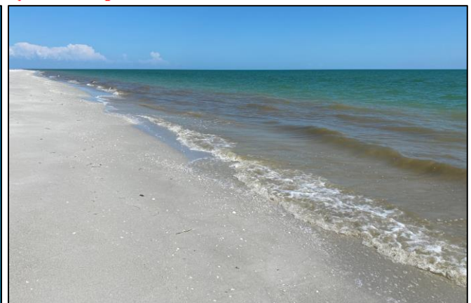
The cyanobacteria Trichodesmium in the surf on 5/18/23 on Sanibel. Sanibel Resident.