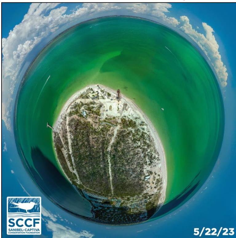
Water clarity at Lighthouse Beach Park on 5/22/23 at 1:40 PM on a high tide (3.2 ft). Lighthouse Beach Park Virtual Tour.

Data are provisional and subject to change.