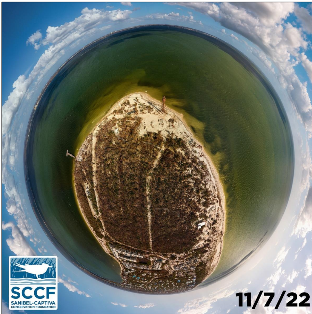
Water clarity at Lighthouse Beach Park on 11/7/22 at 2:36 PM on a falling tide (high tide: 2.23 ft @ 12:12 PM). Lighthouse Beach Park Virtual Tour.

Data are provisional and subject to change.