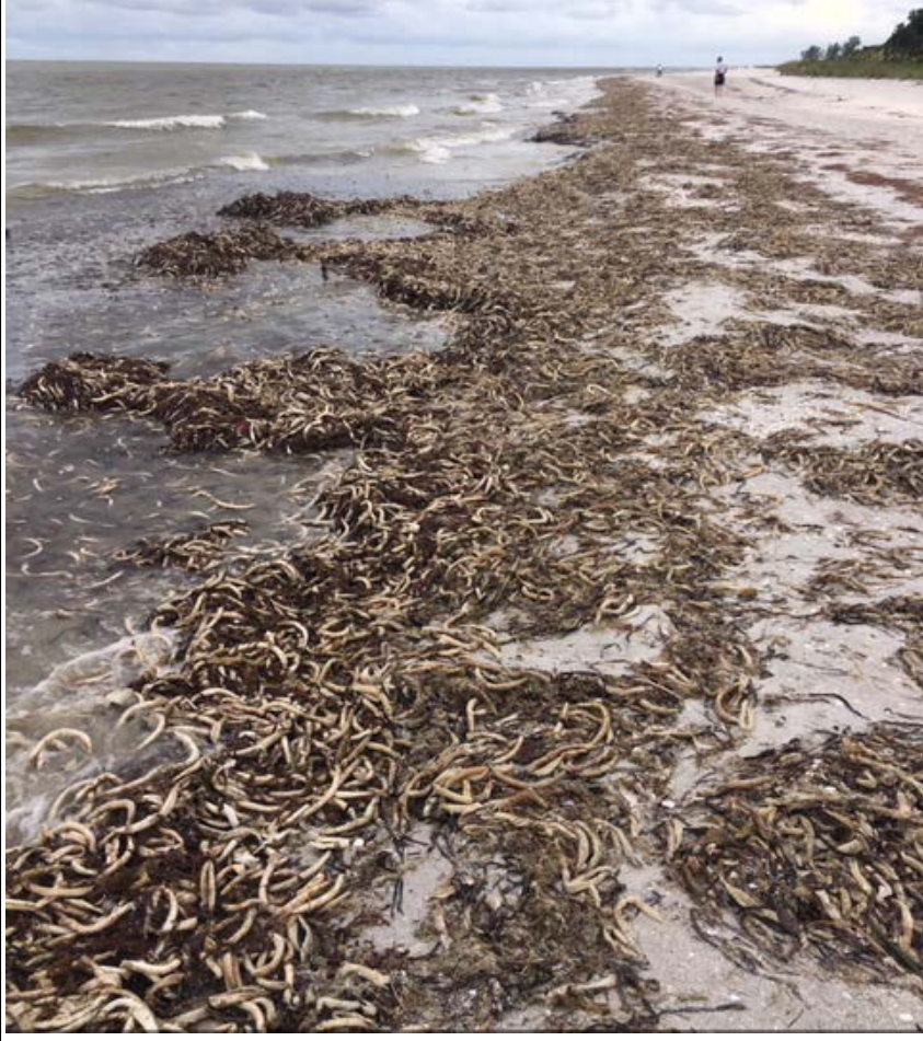
Wrack line dominated by parchment worm tubes at Sanibel's Lighthouse Beach Park on 7/24/18.