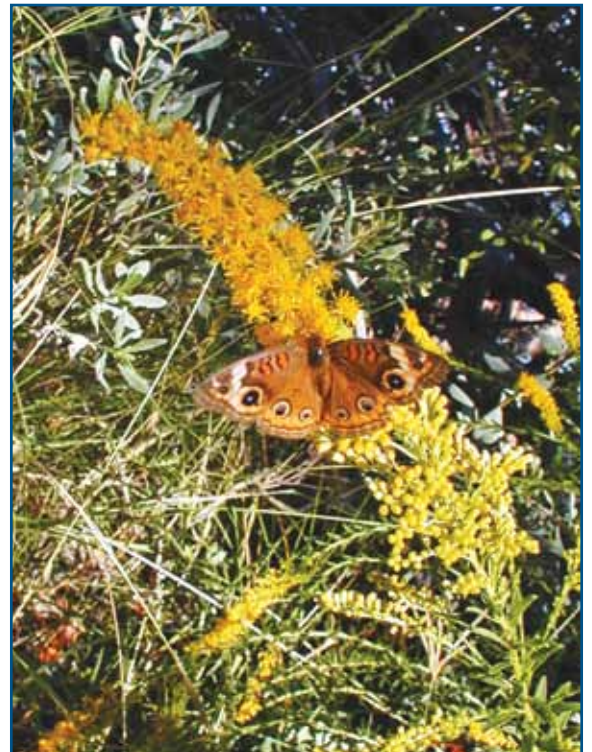
A buckeye butterfly nectars on the Seaside Goldenrod's flowers.