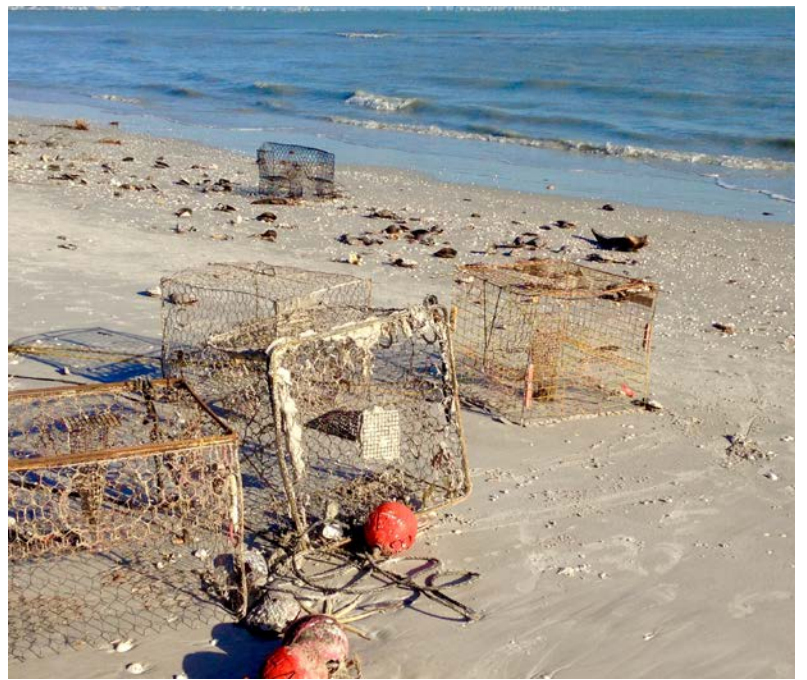
Sanibel Beach 1/24/17. Fred Stanback