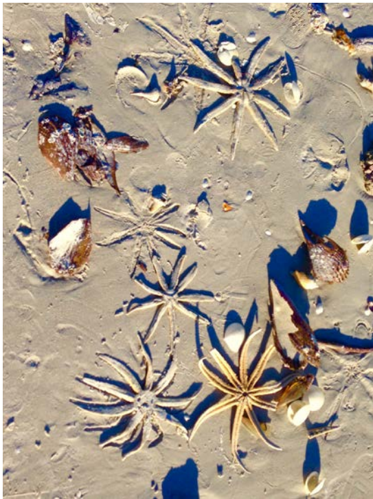
Sanibel Beach 1/24/17. Fred Stanback